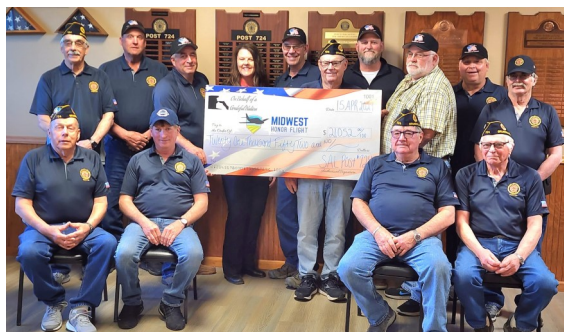
Above: Brunsville Sons of the American Legion and Post 724 members presented a check to the Midwest Honor Flight.