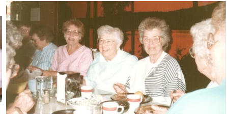
Row above: Spending time at the Corner Café. The photo on the left is dated November 1993.