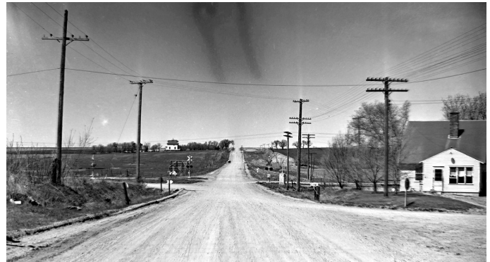
Above: Courtesy of the Plymouth County Historical Museum.