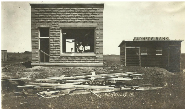
The photo above is dated June 1910.

Left: View of the north side of the main street. L-R: Bank of Brunsville, grocery store, hardware store, pool hall and restaurant, Farmers Bank. Note the dirt road and hitching posts. Below left: Farmers Bank, one of the first buildings in town, was located on the east end of the north side of the main street. The smaller building to the right was later hauled away and used as a chicken coop. Below: The old railroad crossing lights are visible at the town entrance located at the intersection of Jet Road and K42.