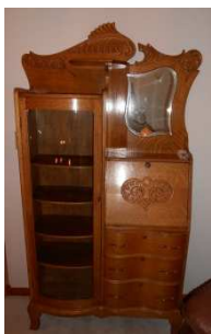
An antique Christy received from her grandparents.