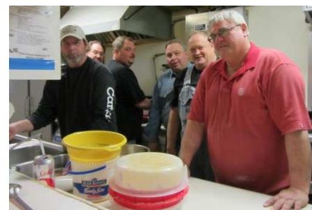
Members of SAL work hard in the Corner Café kitchen during the Rocky Mountain Oyster Feed February 24.