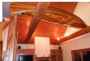
Yes, it's a boat in the living room!