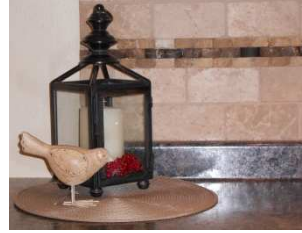
The "basket weave" tile.