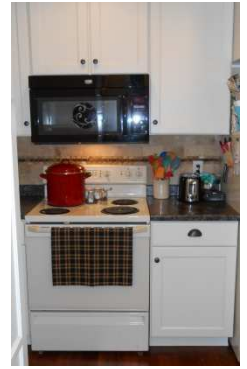
The stove & microwave are located along the east wall.