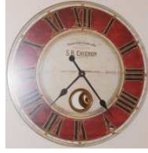
The clock Stan picked out.