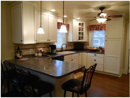
View looking northeast. You can see the bank through the north window.