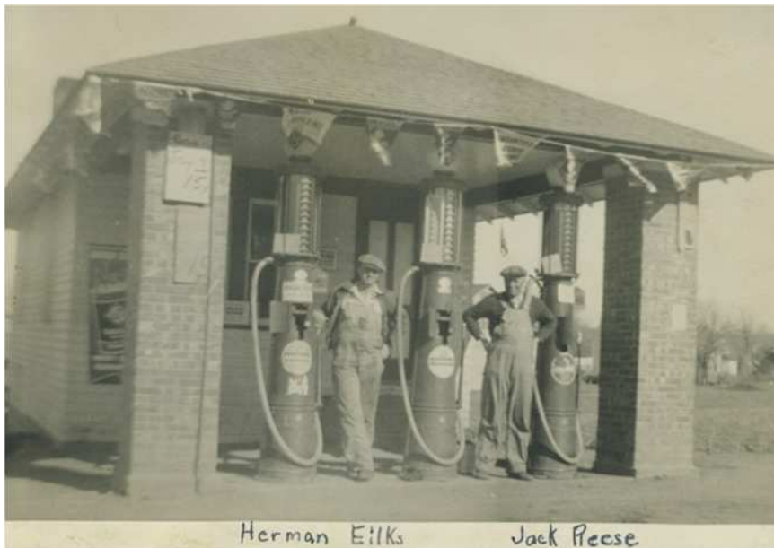
Gene writes: The gas station I worked in for $6 a week.

(Once located on the corner of Jet Road & Elm St.)