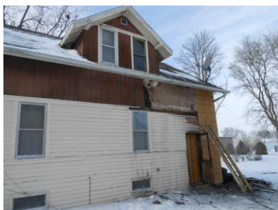
The east back side of the house the day after the fire.