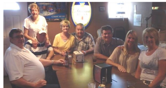
A joyful family get-together.